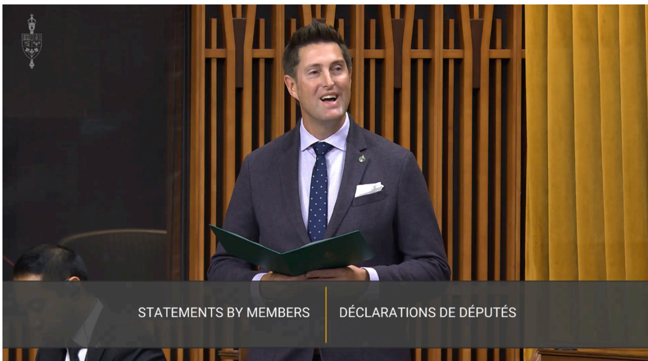
MP Turnbull pictured in the House of Commons recognizing Station Gallery's 29th Annual Art Draw.

I was delighted to speak in the House of Commons to recognize the incredible work of our beloved Station Gallery, who recently hosted their 29th Annual Drawing for Art fundraiser. As many of you may know, Station Gallery is a historic public art gallery that shares art and culture with the community through exhibits, events, performances, programs, and workshops to connect and inspire the community across Whitby and Durham Region. I have had the pleasure of attending Station Gallery's Annual Drawing for Art event in previous years, as it is a key fundraising initiative that supports the Gallery in delivering their important programs to the public. This year, Station Gallery received 160 unique artwork pieces which were generously donated by local and national artists to support the Gallery's continued success. I congratulate the Station Gallery on their 29th Annual Drawing for Art event, and I wish them continued success. It is incredible to see their vision of helping art and culture thrive across Durham Region come to life! My statement can be viewed on Facebook or Twitter .