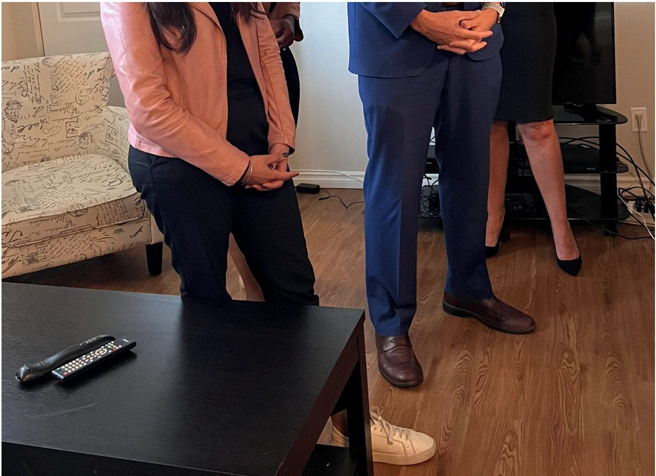
MP Turnbull pictured with Minister Khera at the CMHA Durham group home in Whitby.

After we visited CMHA Durham, Minister Khera and I met with seniors at the Whitby Lawn Bowling Club. We got to test our lawn bowling skills while engaging with the seniors at the club. Operating for 95 years, the Whitby Lawn Bowling Club has been an integral part of our town, promoting staying active and having fun for all members of the community, with a special emphasis on seniors. The Whitby Lawn Bowling Club was also a recipient of the New Horizons for Seniors Program (NHSP) grant this year, and they showed us the positive impact of receiving this fund, whereby they were able to purchase a new lawnmower and allocate money for their members to go to a coaching clinic. The NHSP grant provides funding for projects, such as the Whitby Lawn Bowling Club, that make a difference in the lives of seniors and their communities. Applications for the NHSP are open until November 1st, and I strongly encourage eligible organizations to apply here . It was great to see firsthand how the NHSP funding supports seniors, and I commend the Whitby Lawn Bowling Club for their meaningful contribution to the lives of seniors in Whitby. Lawn bowling is not an easy sport, and I plan to come back to perfect my skills!