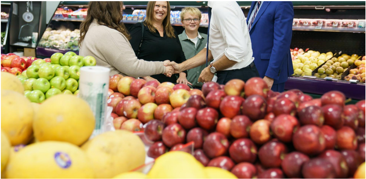
MP Turnbull pictured with Prime Minister Trudeau at Memon Supermarket in Pickering with a local Whitby family.

After our visit to Memon Supermarket, I welcomed Prime Minister Trudeau to Whitby where we visited the Whitby Seniors' Activity Centre. This recreation centre serves as a gathering place for older adults ages 55+ to learn new skills, access resources, and make connections. We met with the seniors and staff at the centre and shared what our government is doing to support seniors across Whitby and Canada, ranging from improving the Guaranteed Income Supplement to boosting the Old Age Security pension. Our government's inclusive affordability plan ensures no one is left behind. We were also delighted to be joined by Whitby's Mayor Mitchell who greeted us at the Whitby Seniors' Activity Centre. It's always a pleasure to connect with our local Whitby seniors.