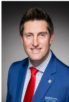
R y a n T u r n b u l l M e m b e r o f P a r l i a m e n t

This is a fantastic funding stream that I highly encourage all eligible organizations to apply to. The deadline to submit an application is November 1st . More information on eligibility criteria and how to apply may be accessed here .