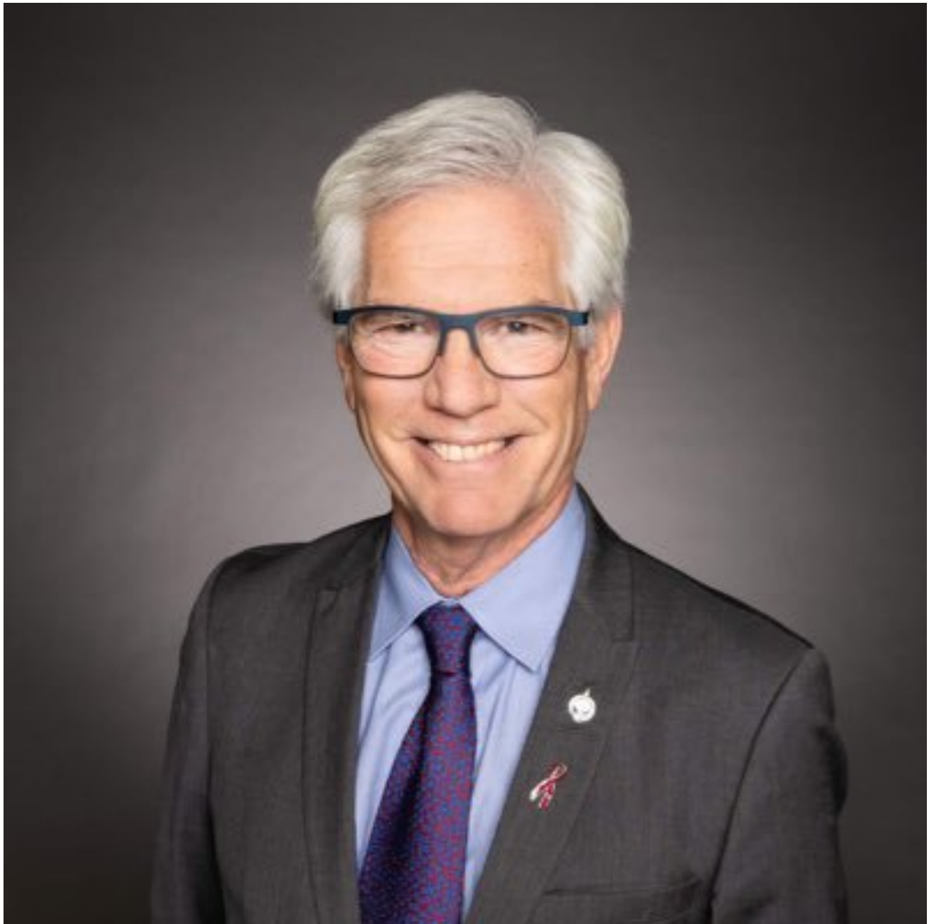
The Honourable Jim Carr, Member of Parliament for Winnipeg South Centre.

and the heart and immense love extending my sincerest condolences to the family during this incredibly difficult time. May he rest in peace.