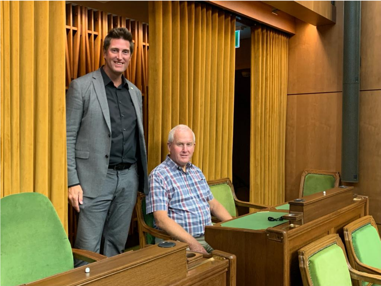
MP Turnbull pictured with Whitby Mayor Mitchell at the House of Commons in Ottawa

Downtown Whitby and Brooklin, to name a few. I was pleased with the meaningful conversations and look forward to the continued collaboration with all levels of government to build a better Whitby for everyone.