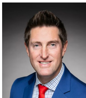
R Y A N T

Challenges surrounding the increased demand for passports are still an issue, but more action is being taken to reduce wait times. The average wait time at call centres has shown notable improvements, decreasing from its peak of 108 minutes in April to 27 minutes last week. More passport offices are expanding for pick-up options across the country to make obtaining a passport more efficient. As I shared last week, individuals who submitted an application by mail more than 20 business days ago and are travelling within the next 20 business days may visit any Service Canada centre to make a transfer request to ensure their application is processed in time for travel. I am hopeful we will continue to see improvements with the added measures.